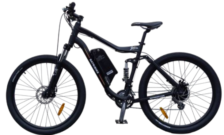
Model shown: BATRIBIKE Storm in Matt Black